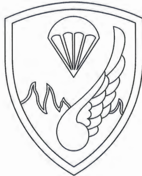
LINE w/o TAB